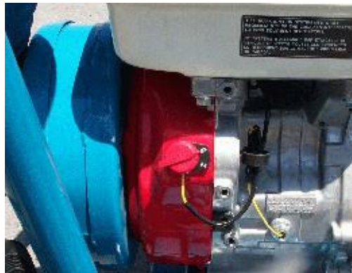
Fig. 6 Shut-off switch

Be sure to test the shut-off switch before depending on it (see Fig. 6), the shut-off switch is located on the back-side of Honda engine.