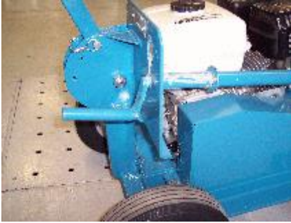
Fig. 4 Depth control in idle position

The depth control (see Fig. 4 and Fig. 5) is located on the right side of the handle assembly. Figure 4 shows the control in the idle position and figure 5 shows the cutting position. Turning the crank clockwise adjusts the cutting depth lower; counter-clockwise rotation of crank raises the cutting blade. Operator must be familiar with operation of this control before using roof cutter on the job.