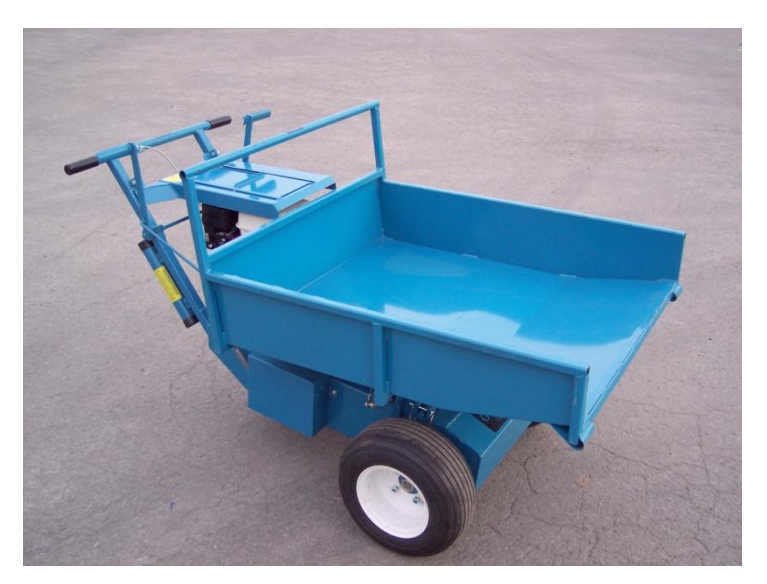
#340 700 Dump tray