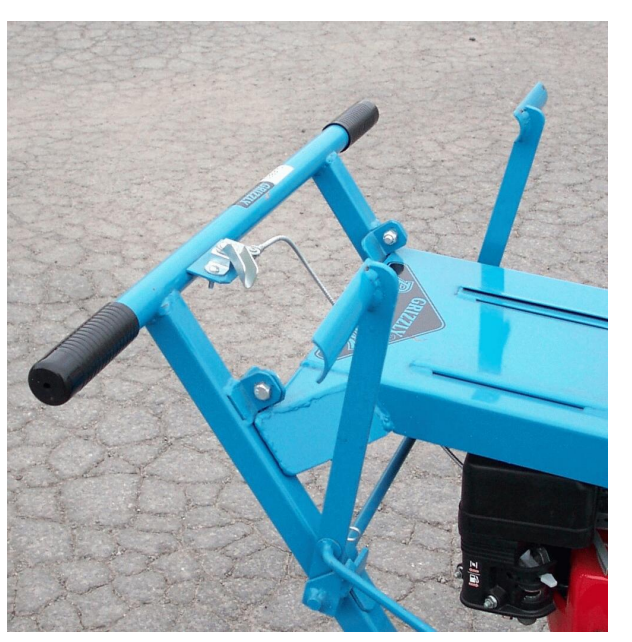
Fig. 3 Levers in brake on, clutch disengaged position

Make sure the clutch and brake levers aren't being pulled back (held) against the handle bar (pulling on the brake lever will release the brake and engage the clutch) (See Fig. 3)