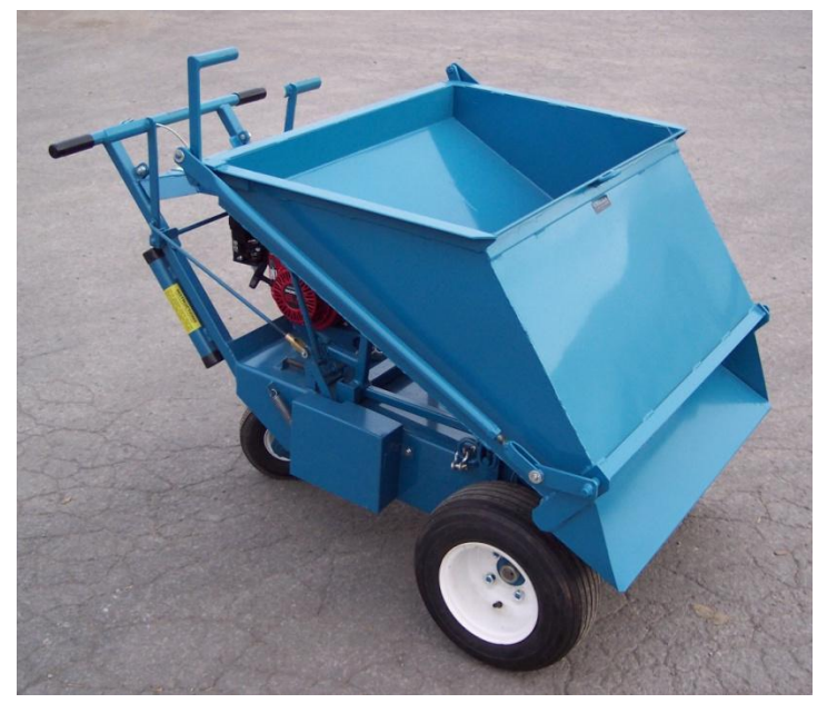
340 500 Gravel dispenser

Install channel irons, tank and rods as shown in Fig. 7 (Refer to operation section on use of hot tanks)