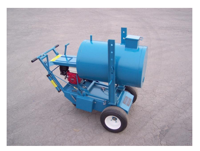
Fig. 7 Hot stuff tank attachment

Install channel irons, tank and rods as shown in Fig. 7 (Refer to operation section on use of hot tanks)