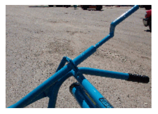
Fig. 5 Depth control in operating position