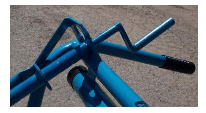
Fig. 3 Roof Cutter in idle position

After checking the blade installation (refer to the blade installation section), put the depth control in the idle position and make certain the control is set so that blade does not come in contact with the roof deck (Fig. 3) Pushing down on the handles will allow the depth control to slide to the idle position.