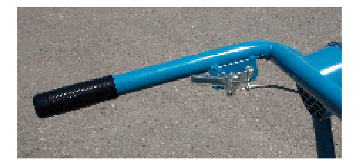
Fig. 6 Throttle control

The throttle is located on the left hand side (see Fig. 6). Lowering lever handle decreases the engine speed. Raising the lever increases the engine speed.