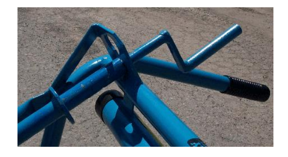
Fig. 4 Depth control in idle position

The throttle is located on the left hand side (see Fig. 6). Lowering lever handle decreases the engine speed. Raising the lever increases the engine speed.