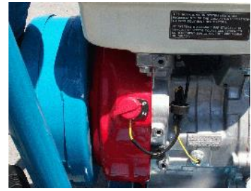
Fig. 7 Shut-off switch

Be sure to test the shut-off switch before depending on it (see Fig. 7), the shut-off switch is located on the back-side of Honda engine.