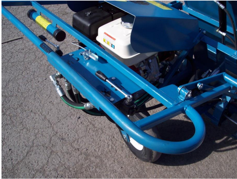
Fig. 9 All levers on neutral, brake on

At this point, after you have read through all of the instructions, the workhorse should be ready for operation.