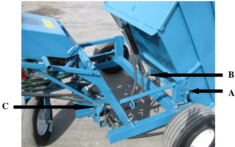
Fig. 6 Dump tray (or felt & insulation carrier)