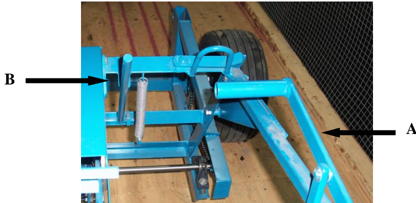
Fig. 4 A- Gravel dispensing lever B- Dump hopper released lever

Gravel dispensing lever (A) is located furthest to the right (Fig. 4.) Pulling back on handle opens discharge door of gravel dispenser. Pushing forward on lever closes door. For instructions on installation of linkage and lever, refer to next section (Gravel spreader attachment)