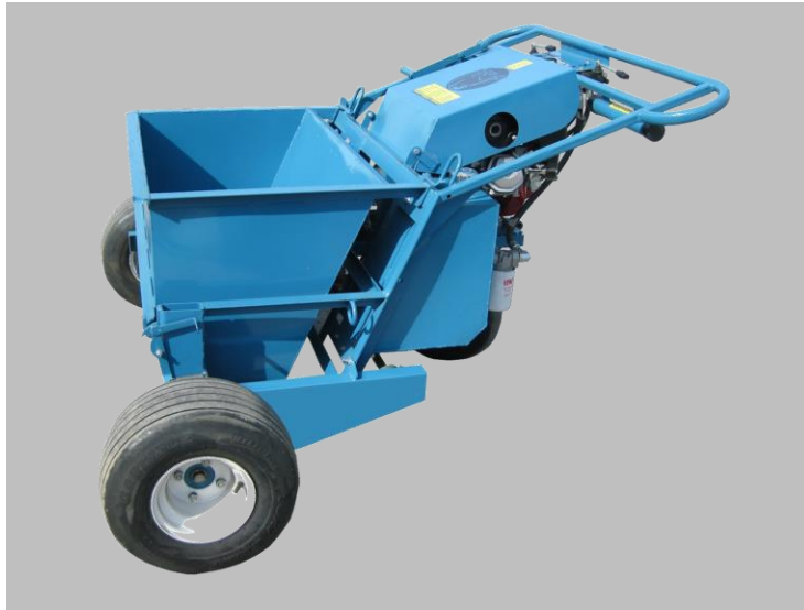
Fig. 5 Gravel spreader

Wrenches are required for installation. Install gravel spreader as shown in fig. 5. Shaft ends of spreader drop into mount brackets on the frame. To install handle and linkage, first attach linkage to dispenser and then connect the other end with handle and secure with bolt and nut provided. Clockwise adjustment of the screw will make dispenser door open less; counter-clockwise makes door open more. Yoke assembly on back of dispenser is preset to proper door tension. If more tension is needed for door closure, remove the bolt and nut on the yoke and tighten as needed.