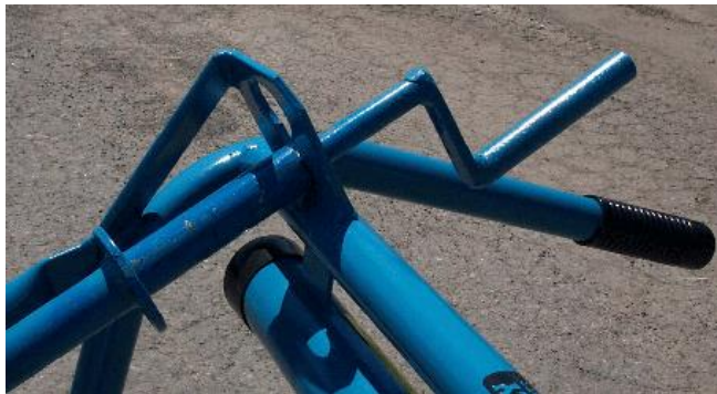
Fig. 3 Roof Cutter in idle position

After checking the blade installation (refer to the blade installation section), put the depth control in the idle position and make certain the control is set so that blade does not come in contact with the roof deck (Fig. 3) Pushing down on the handles will allow the depth control to slide to the idle position.