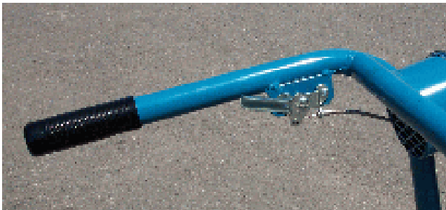
Fig. 6 Throttle control

The throttle is located on the left hand side (see Fig. 6). Lowering lever handle decreases the engine speed. Raising the lever increases the engine speed.