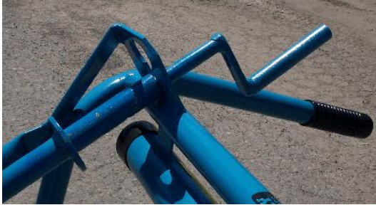
Fig. 4 Depth control in idle position

The throttle is located on the left hand side (see Fig. 6). Lowering lever handle decreases the engine speed. Raising the lever increases the engine speed.