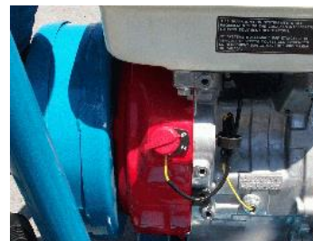
Fig. 7 Shut-off switch

Be sure to test the shut-off switch before depending on it (see Fig. 7), the shut-off switch is located on the back-side of Honda engine.